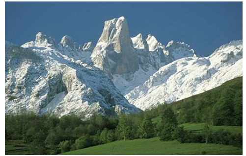
Portrait of Asturias